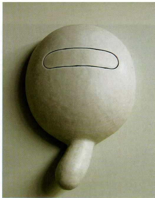
Pichu . 2003. Low-fired white clay, glaze, wood. 122 x 33 x 43 cm

His work is primal, mystical and just plain beautiful. While elements of sexual innuendo abound, sexual implication is blended with beauty to attain deeper levels of sensual understanding. There are