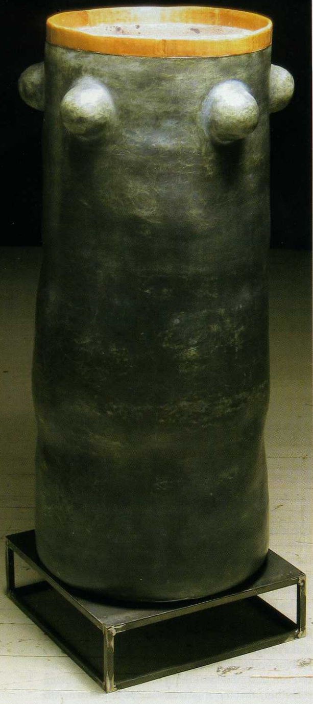
Megas . 2004. Low-fired white clay, oxides and wood. 97 x 43 x 43 cm.