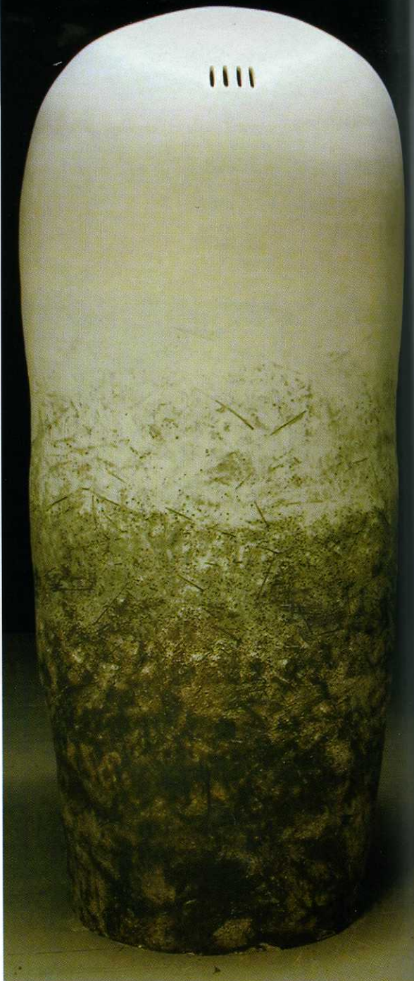
Mimi . 2003. Low-fired white clay and oxides. 120 x 48 x 41 cm.